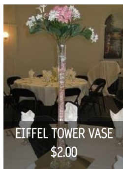
EIFFEL TOWER VASE $2.00

ONLY GLASSWARE INCLUDED IN CENTERPIECE RENTALS. CANDLES, FLOWERS, AND OTHER DÉCOR NOT INCLUDED.