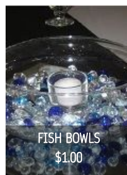
FISH BOWLS $1.00