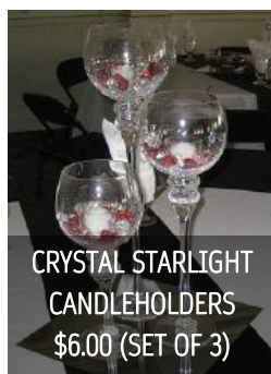
CRYSTAL STARLIGHT CANDLEHOLDERS $6.00 (SET OF 3)