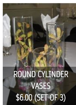
ROUND CYLINDER VASES $6.00 (SET OF 3)